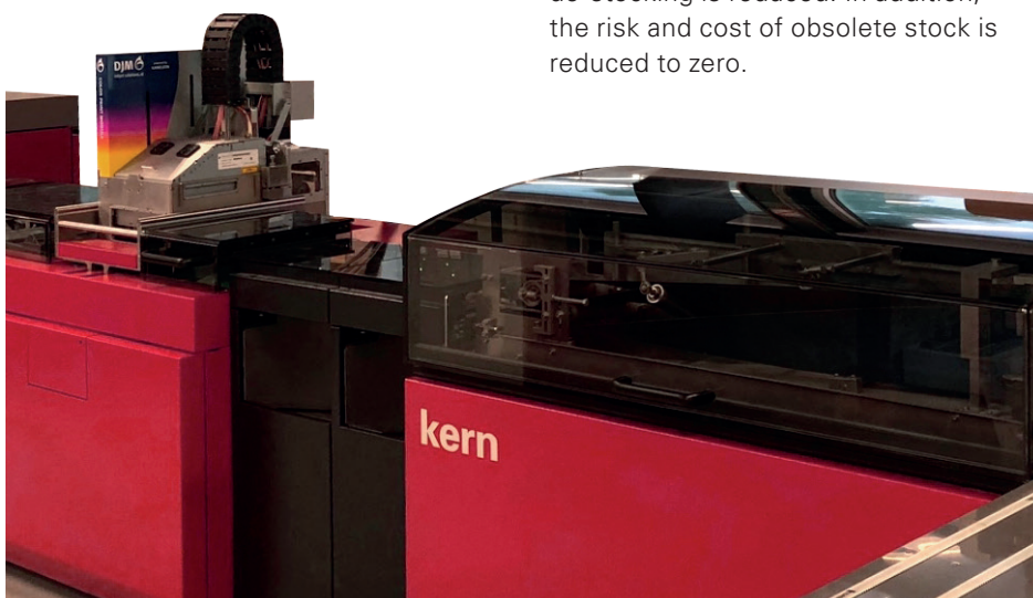
DJM C500 integrated in Kern 3600 with Print@Exit