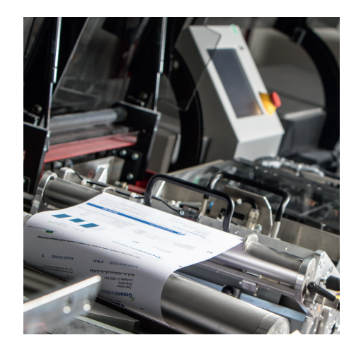
Kern AG 3510 Konolfingen Switzerland

Phone +41 31 790 35 35 info.switzerland@kernworld.com www.kernworld.com